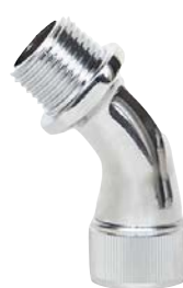
Adapter Colour: Silver Pack Weight: 0.02 kg Pack Size: 5 x 3 x 5 Wholesale: Email us RRP: $19.00