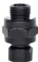
Adapter Colour: Black Pack Weight: 0.02 kg Pack Size: 5 x 3 x 5 Wholesale: Email us RRP: $19.00