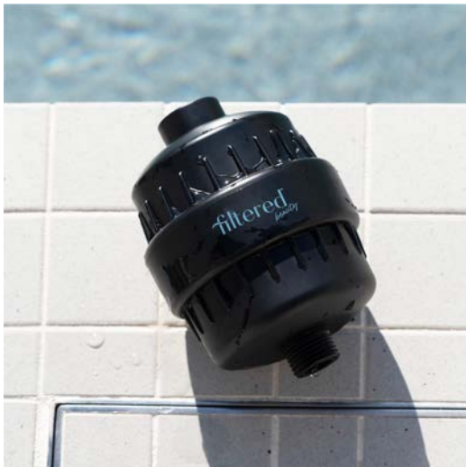
Shower Purifier Colour: Black Pack Weight: 0.45 kg Pack Size: 14 x 9 x 14 Wholesale Price: Email us RRP: $84.00

Filtered Beauty enhances your beauty routine by removing hidden impurities from your shower, giving you the purest start to your self-care regimen!