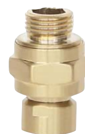
Adapter Colour: Brushed Gold Pack Weight: 0.02 kg Pack Size: 5 x 3 x 5 Wholesale: Email us RRP: $19.00