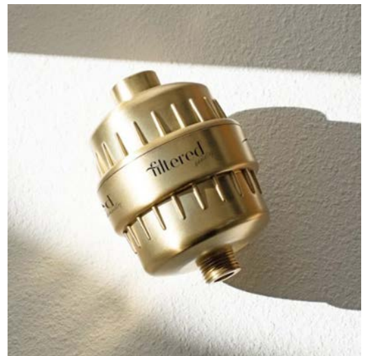
Shower Purifier Colour: Brushed Gold Pack Weight: 0.45 kg Pack Size: 14 x 9 x 14 Wholesale Price: Email us RRP: $84.00