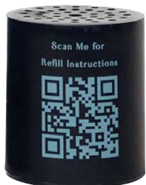
Shower Purifier Filter Refill Colour: Black Pack Weight: 0.3 kg Pack Size: 7.5 x 6.7 x 7.5 Wholesale: Email us RRP: $52.00