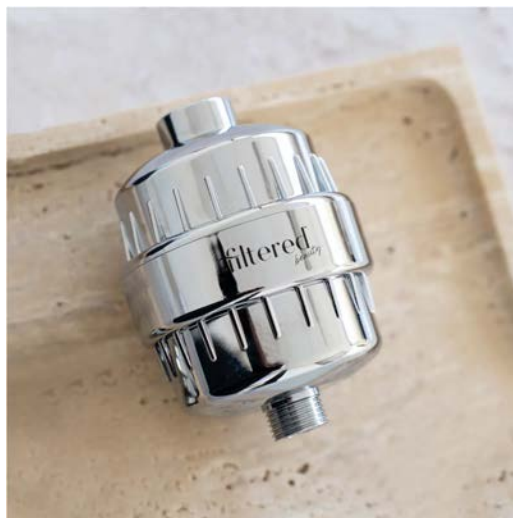
Shower Purifier Colour: Silver Pack Weight: 0.45 kg Pack Size: 14 x 9 x 14 Wholesale Price: Email us RRP: $84.00