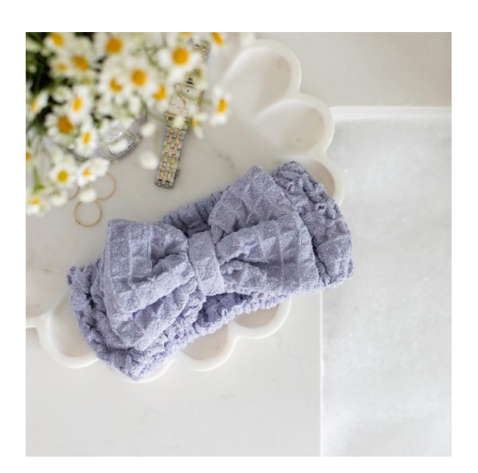
Colour: Lilac Pack Weight: .58kg Pack Size: 16 x 8 x 3 Wholesale Price: Email us RRP: $19.99

Keep your hair protected and away from your face while applying makeup, cleansing your face or relaxing at home. This cotton headband comes in one size with an elastic inside to provide a comfortable fit for everybody.