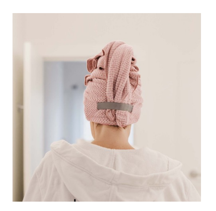
Colour: Blush Pack Weight: .128kg Pack Size: 27 x 7 x 16 Wholesale Price: Email us RRP: $32.99

Experience luxury in hair care with The Pomme Hair Towel, designed with a soft waffle weave microfibre that quickly absorbs more water than a regular towel while being gentle on your hair! Complete with an elastic to hold the towel in place while you get ready or un-ready!